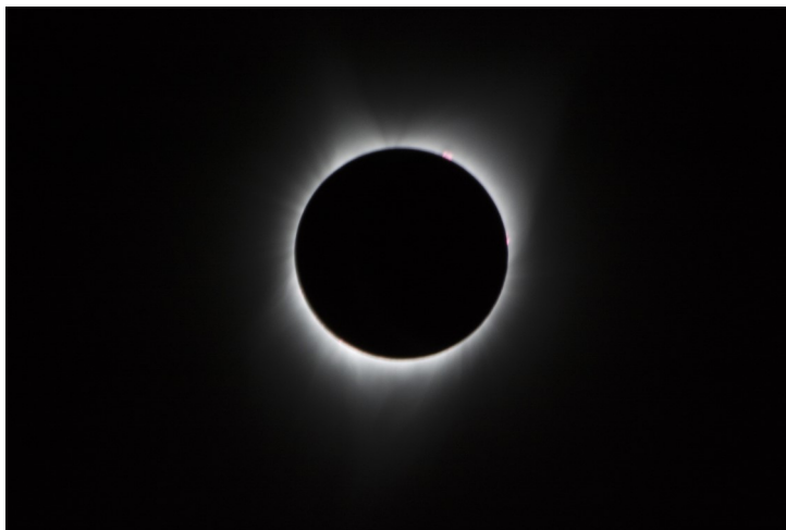
(This photo is from Nasa.org. Amazing how neatly the Moon fits within the Sun. The Sun is 400 times larger than the Moon and 400 times farther away from the Earth.)