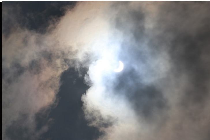
(We were fortunate to have some cloud cover.)