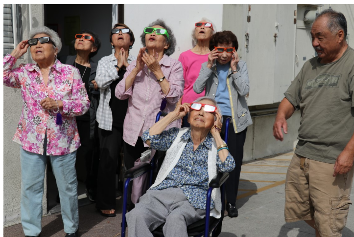
(It was not a full eclipse, but it was still spectacular)

Again as Amida's followers, there was no reason to feel guilty for rushing service. We are always receiving Amida's infinite wisdom and great compassion. It urges us to use our time to expand Amida's Light within and share the feelings that emerge. As you can see on our faces, that the temple provided this shared experience. Do not waste time. Take a moment to listen and make an effort to reflect within. It is easy to take nature for granted. It is easy to miss out on the ever-changing world around us. It is easy to miss out on the valuable lessons that are right in front of us and guide us. We cannot experience everything, but we can try and treat each moment as "once in a lifetime." Then say Namu Amida Butsu for helping us to realize something so valuable and meaningful. Gassho.